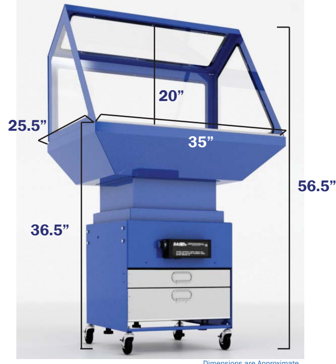
Dimensions are Approximate